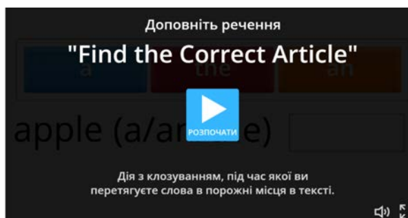
Fig. 4. “ Find the Correct Article ” game, created using the Wordwall platform

Rules of the game: The teacher needs to create a game on the Wordwall , where a noun will be given at each stage. Students must choose the correct article (“a/an” or “the”) for this noun. If the answer is correct, the student receives a certain number of points. The player with the most points wins the game (Fig. 4–5).