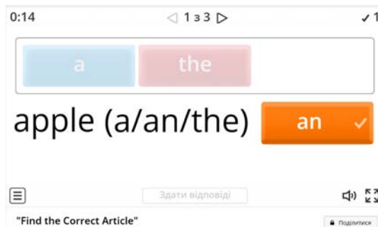
Fig. 5. "Find the Correct Article" game, created using the Wordwall platform

This game will help students practice the topic of the articles “a/an” and “the” in English through an interactive and exciting way, making the learning process more effective and interesting.