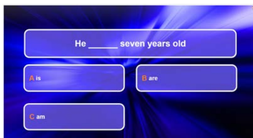
Fig. 3. The game “ Who Wants to Be a Millionaire? ”, created using the LearningApps.org platform

Rules of the game: Students choose a question for which they can receive a different number of points, depending on the difficulty of the question, choose an answer and receive their points. Whoever gets the highest points wins (Fig. 3).