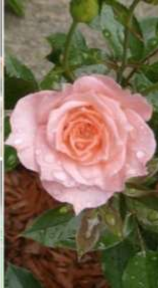
Fig. 4. Julie Andrews rose.