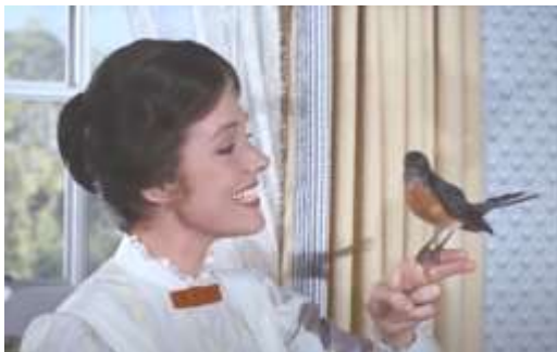
Fig. 7. Mary Poppins , 1964. Sings with a bird.