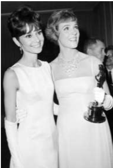
Fig. 3. Andrews Hepburn and Julie Andrews, 1965.

Mary Poppins beat out My Fair Lady and topped the box office that year. As the cherry on top of her victory, Andrews also won an Oscar (1965) and a Golden Globe for her portrayal of the flying nanny. While this kind of rivalry could have made for a huge Hollywood feud, through it all, Andrews and Hepburn remained good friends [44], see video [21], (Fig. 3, 6, 7, 8).