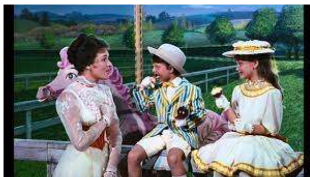
Fig. 15. Children with ice cream.

She may be tricky, but she's bloody good! So when the cat has got your tongue There's no need for dismay Just summon up this word And then you've got a lot to say But better use it carefully Or it could change your life For exemple One night I said it to me girl And now me girl's my wife! And what a lovely wife she is too She's supercalifragilisticexpialidocious! Supercalifragilisticexpialidocious Supercalifragilisticexpialidocious Supercalifragilisticexpialidocious [26], video [27].