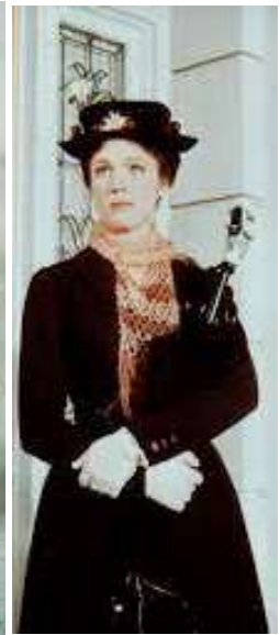
Fig. 6. Andrews as Mary Poppins.