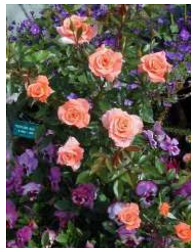
Fig. 35. Julie Andrews. Fig. 36. The rose Julie Andrews