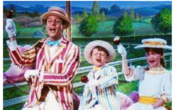
Fig. 11. Movie Mary Poppins , 1964

It's... Supercalifragilisticexpialidocious! Even though the sound of it Is something quite atrocious If you say it loud enough You'll always sound precocious Supercalifragilisticexpialidocious! Um diddle diddle diddle um diddle ay Um diddle diddle diddle um diddle ay!