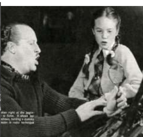
Fig. 21. Vocal lesson with stepfather.