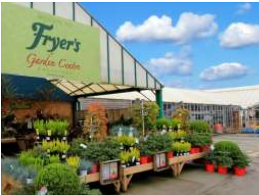
Fig. 33. Fryer's Garden Centre.

Fryer's Garden Centre is situated in the heart of Cheshire, nestled neatly between the picturesque town of Knutsford and the beautiful landscape of Tatton Park. Fryer's Garden Centre ( Fig. 33, 34 ) is renowned for its extensive range of both indoor and outdoor plants and in particular for its range of over 200 Fryer's bred roses, many of which have won awards worldwide [1].