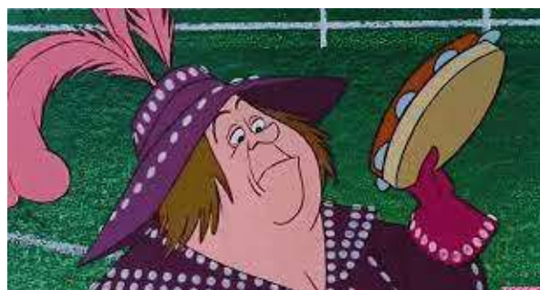
Fig. 16. She's....