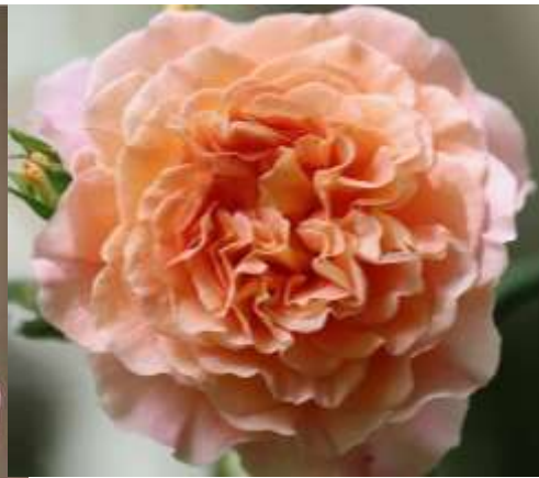
Fig. 18. The rose Julie Andrews, 1992.