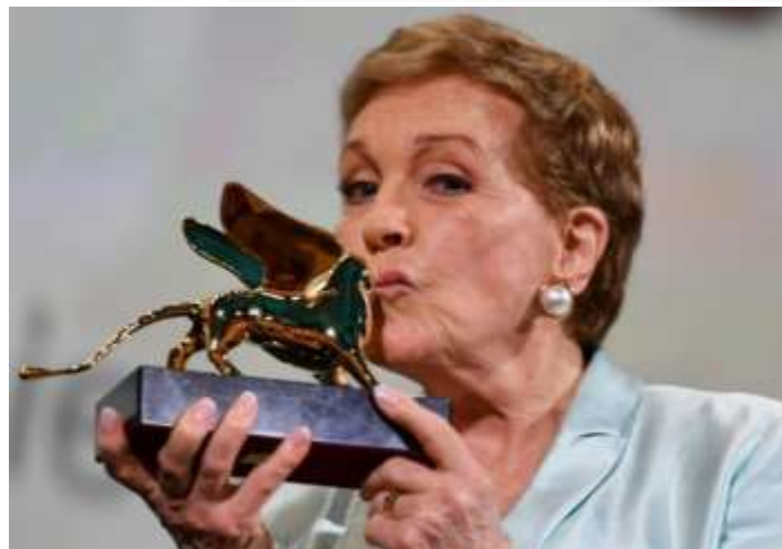
Fig. 28. Roses Julie Andrews. Fig. 29. Julie Andrews (83). Venice film festival. 2019.