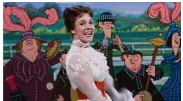
Fig. 13. Julie Andrews as Mary Poppins .

Supercalifragilisticexpialidocious! Even though the sound of it Is something quite atrocious If you say it loud enough You'll always sound precocious Supercalifragilisticexpialidocious! Um diddle diddle diddle um diddle ay Um diddle diddle diddle um diddle ay!