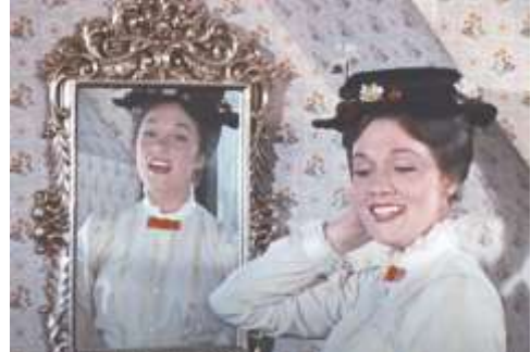
Fig. 8. Song "A Spoonful Of Sugar".