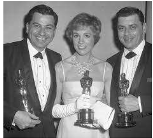
Fig.10. The Sherman Brother and Julie Hollywood, 1965.

Coincidentally, there was also a song called Supercalafajalistickeespeealadojus that was written in 1949, and the authors of the song brought a suit against the Sherman brothers for copyright infringement. In the end, the court decided in the Shermans' favor because, among other things, affidavits were produced that claimed that variants of the word were known many years prior to 1949, making the plaintiffs' claim unfounded [46].