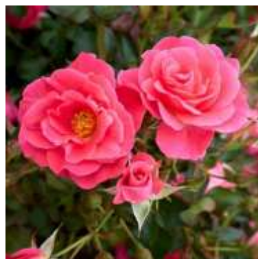
Fig. 42. Blooming roses Julie Andrews. 43. Blooming of roses.