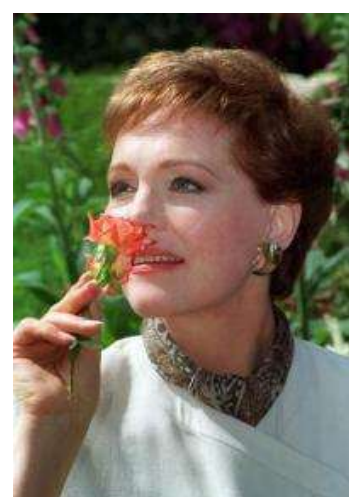
Fig. 2. Julie Andrews [11].

Julie Andrews (Fig. 2) wore an empire-waist gown when she won her Oscar in 1965 for playing Mary Poppins. The stunning star paired the look with long white gloves and a bib-style necklace [41]. In 2013, the film was selected for preservation in the United States National Film Registry by the Library of Congress as being