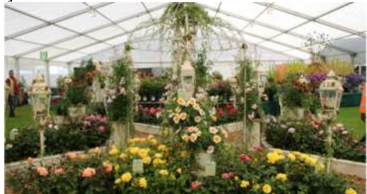
Fig. 34. Exhibition of plants in Fryer's Garden Centre.