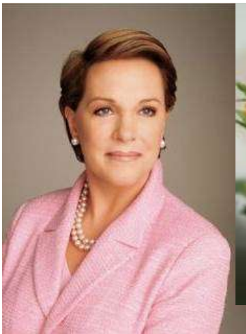
Fig. 17. Julie Andrews.