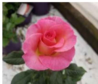
Fig. 39. Flower.

Foliage Color: Dark Green Flower Color Pink (Fig. 42). Rose bloom color: Orange pink. Height: 90–120 cm. Spacing: 60–90 cm. Light needs: Full sun; Partial sun. Plant Habit: Fern. Life cycle: Biennial. Flower Time: Spring; Summer. Uses: Useful for timber production. Wildlife Attractant: Other Beneficial Insects. Fig. 45. Flowering rose. Propagation: Cuttings: Stem Slightly acid (6.1 – 6.5) [4; 40]