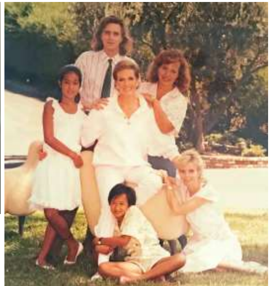
Fig. 19. Julie Andrews with her 5 children.

Julie Andrews, in full Dame Julie Andrews, original name Julia Elizabeth Wells, (born October 1, 1935, Walton-on-Thames, Surrey, England), English motion-picture, stage, and musical star noted for her crystalline four-octave voice and her charm and skill as an actress [7], see video [49] .