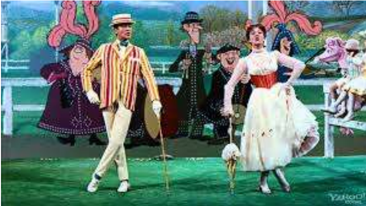
Fig. 9. Song "Supercalifragilisticexpialidocious". Andrews, from movie Mary Poppins .

For many people, supercalifragilisticexpialidocious and the 1964 movie Mary Poppins are inextricably linked. Indeed, it was this movie that popularized the word. The songwriters, brothers Richard and Robert Sherman, have explained the word as originating in the same way they, like many others, used to make up humorously big, nonsensical words as children [46] (see video [45]).