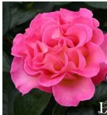
Fig. 31. Elegance rose Julia Andrews.