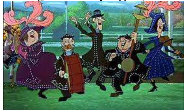
Fig. 12. Music band,

Because I was afraid to speak When I was just a lad My father gave me nose a tweak And told me I was bad But then one day I learned a word That saved me achin' nose The biggest word I ever heard And this is how it goes: Oh! Supercalifragilisticexpialidocious! Even though the sound of it Is something quite atrocious If you say it loud enough You'll always sound precocious Supercalifragilisticexpialidocious! Um diddle diddle diddle um diddle ay Um diddle diddle diddle um diddle ay! He traveled all around the world And everywhere he went He'd use his word and all would say "There goes a clever gent" When Dukes and maharajas Pass the time of day with me I say me special word and then They ask me out to tea Oh..