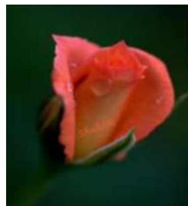
Fig. 38. Flower bud.