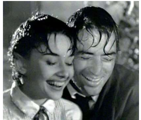
Fig. 16. Two lovers.

And the first kiss... The night of dancing ends with an escape jump into the Tibre river. Still soaking wet when ashore, they embrace and share a kiss (see video [12]), (Fig. 16, 17, 18). One of the most moving kisses in the entire history of cinema. They're about to part for ever.