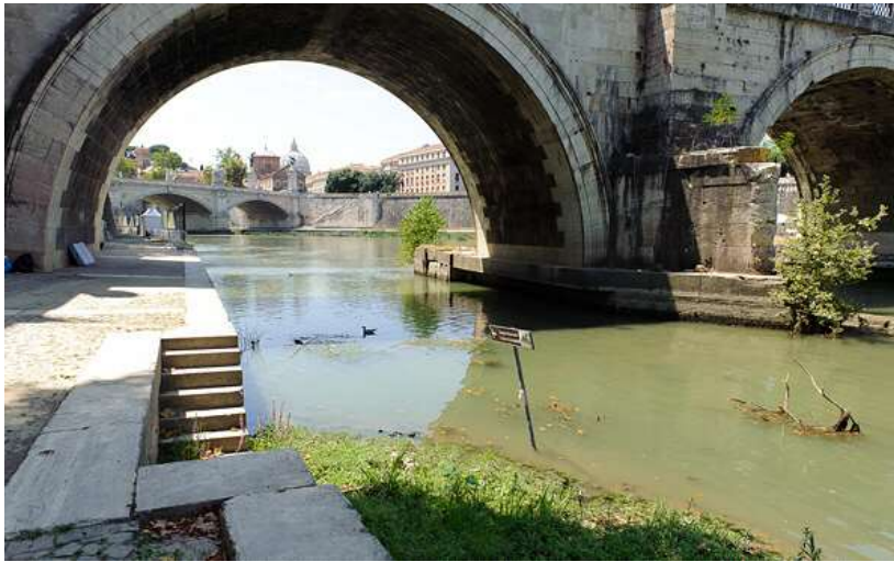
Fig. 15. The dwarf with the stairs