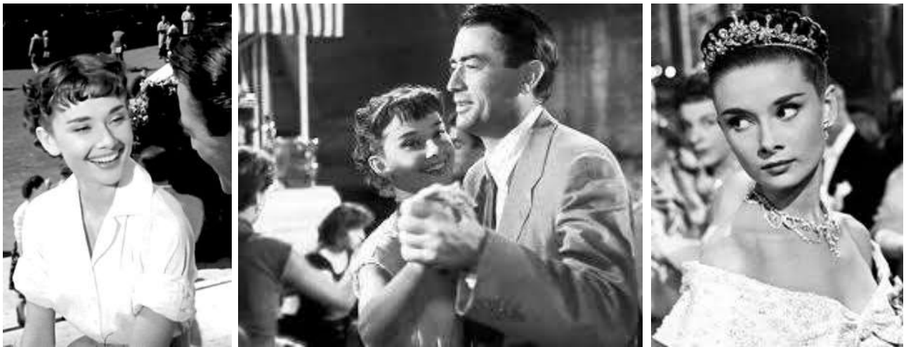
Fig. 4. On the Spanish steps. Fig. 5. Ann's dancing with Joe. Fig. 6. A modern-day princess.

Roman Holiday (1953) was nominated for ten Academy Awards, and Audrey Hepburn captured an Oscar for her portrayal of a modern-day princess rebelling against her royal obligations who explores Rome on her own. She meets Gregory Peck, an American newspaperman who, seeking an exclusive story, pretends ignorance of her true identity. But his plan falters as they fall in love. Eddie Albert contributes to the fun as Peck's carefree cameraman pal. Stylishly directed by William Wyler, this romantic comedy ranks as one of the most enjoyable films of all Times [12], (Fig. 4, 5, 6, 8).