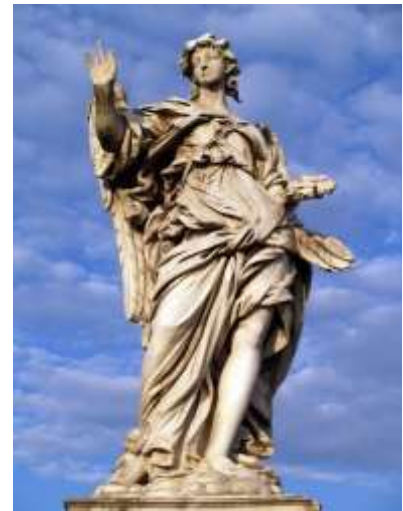
Fig. 24. Angel with Veronica's Veil. Fig. 25. Angel with His His Garment and Dice.