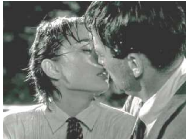
Fig. 18. The first kiss...

A love story that merits being fully understood, and definitely a movie that is worth seeing. It is also worth a visit to all the attractions that appear in the "Roman Holiday," that together make the city of Rome, the Ancient capital of the world, a destination that deserves to be seen and loved, Rome [18].