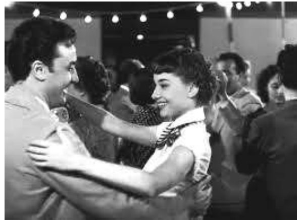
Fig. 11. On a barge on the Tiber River.