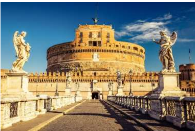
Fig. 7. Castel Sant'Angelo.

Castel Sant'Angelo (Night of Dancing on the River) . Although it is no longer there, the barge used to be moored between Ponte Vittorio Emanuele II (1886) and Ponte Sant'Angelo (134 AD), located at the foot of Castel Sant'Angelo, a 2nd century mausoleum of the Roman Emperor Hadrian. Over the centuries it has served as a castle, papal residence, prison and is now the National Museum of Castel Sant'Angelo [19] (Fig. 2, 7), see videos [2; 3] .