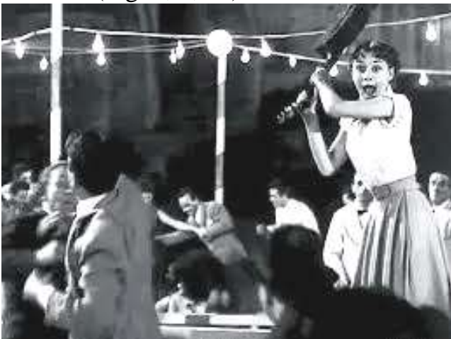
Fig. 13. The fight.

Gregory Peck said: "It was my good luck during that summer in Rome to be the first of her cinema swings, to hold out my hand and help her keep her balance as she did her spins and pirouettes and made practically everybody in the world fall in love with her (Fig. 5, 8, 10).