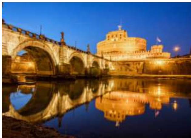
Fig. 2. The Tiber banks of Castel Sant'Angelo.

Scholars think that name Tiber dates to ancient times, It originated in another language before the Latin "Tiberis". The Tiber is also called flavus ("the blond") because of the yellowish hue of its water [9].