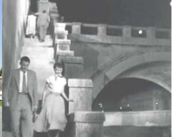
Fig. 9. The Ponte degli Angeli bridge.