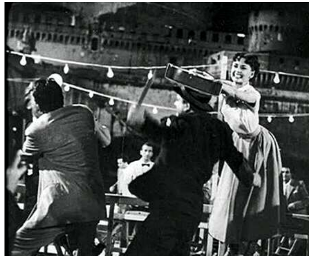
Fig. 14. The "crowned head" of the night.

In the movie, during the fight with the Royal investigators the two lovers fall in the Tiber, and swim ashore. We can see in the Fig. 15 the dwarf with the stairs where they actually swam out of the Tiber in the movie. In the distance we can see after the Ponte degli Angeli another bridge, the Ponte Duca d'Aosta, leading to St. Peter's, whose dome is visible [16], ( see video [12]), Fig. 15