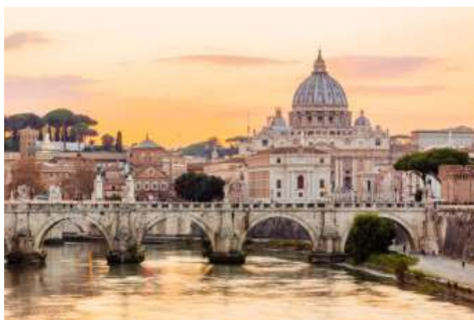
Fig. 1. The Tiber in Rome.

Candidate of Pedagogic Sciences, Associate Professor Dragomanov National Pedagogical University