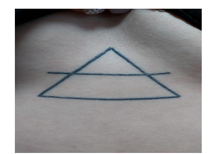
Fig. 2. Respondent O.'s own tattoo: «Symbol of Air»

Let's give an example: respondent O. was asked to make the psychodrawing «My Own Tattoo». O. took a photo of the tattoo on her body (Fig. 2).