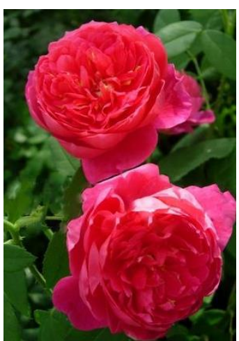
Fig. 8. Benjamin Britten rose.