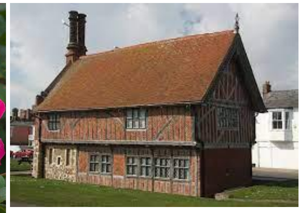
Fig. 15. The ancient Moot Hall near the beach .