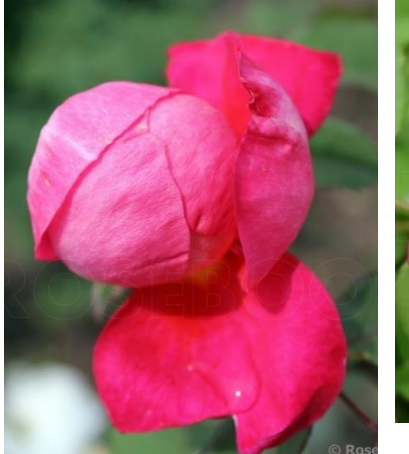
Fig. 28. Flower bud open.

Flowers may be followed by showy red or purple fruits in some varieties. Shrub roses are large shrubs with usually thorny stems bearing large leaves and fragrant, single to double flowers in clusters in summer, and usually also in autumn [42].