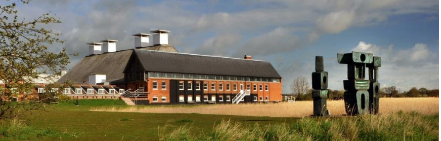
Fig. 22. Around Snape Maltings.

delight to visit for its architectural interest,