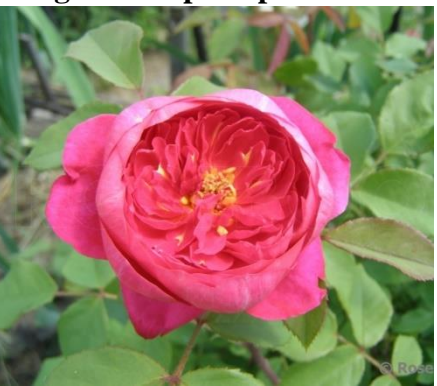
Fig. 32. Unusual coloring.