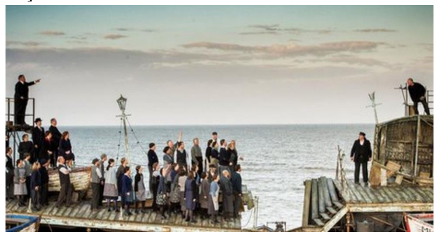
Fig. 7. The opera ''Peter Grimes'' (1945).

Edward Benjamin Britten (1913–1976) was an English composer, conductor and pianist (Fig. 3). He's best-known for his substantial operatic output, including Peter Grimes (Fig. 7), the video [10]), Billy Budd and The Turn of the Screw , among others, but also wrote song cycles [55] and a large number of orchestral works ( the videos [12; 14; 16].