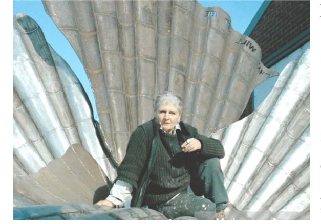
Fig. 17. Maggi Hambling on the Scallop (2004).

M. Hambling sees Scallop as more than just a sculpture. It was designed to also be a shelter and a seat, a place where visitors can rest and 'contemplate the mysterious power of the sea'. She wants people to interact with it: 'When somebody climbs up on it to sit down and watch the sea' [26]. It is a gift from the artist for everyone to enjoy.