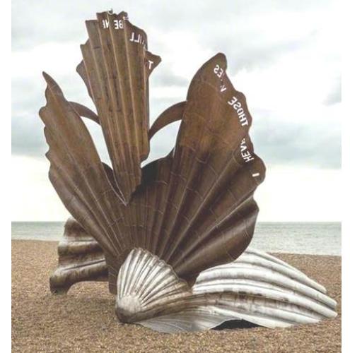
Fig. 16. The Scallop sculpture (2003).

the shell lies prone, making a sort of platform [26].