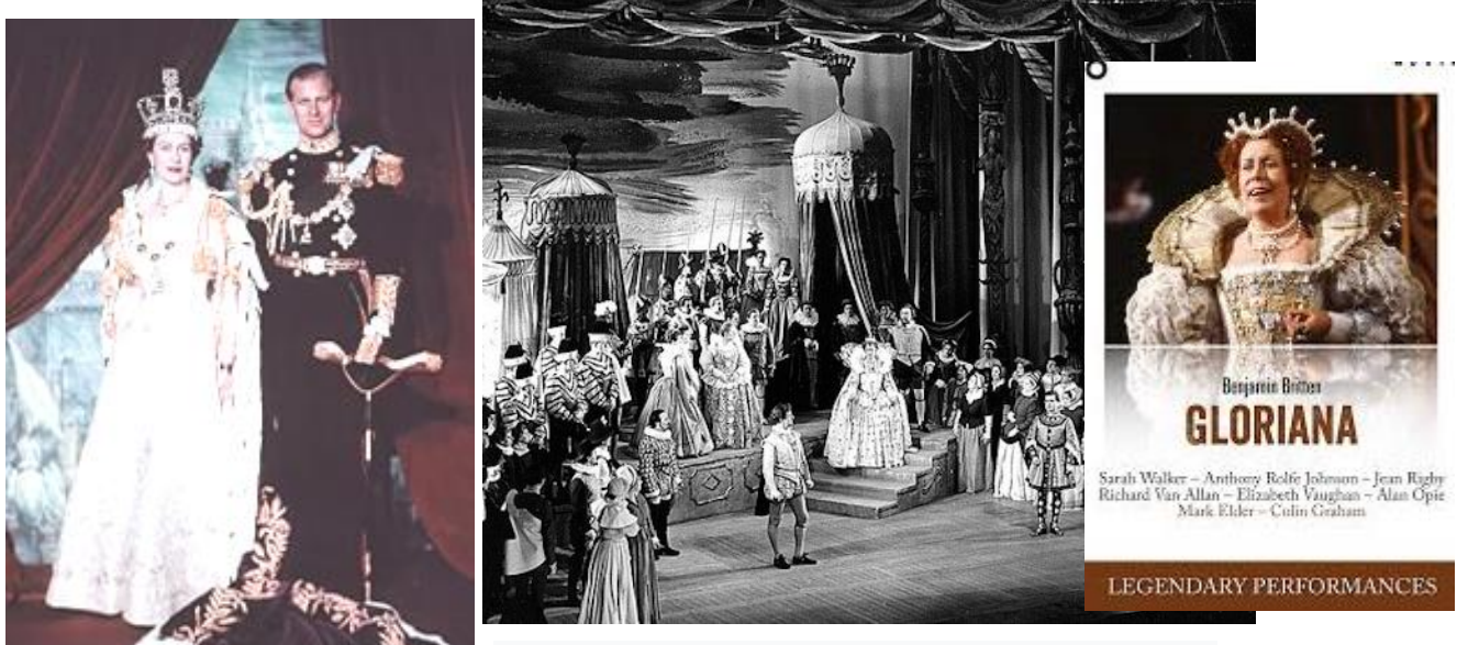
Fig. 5. Legendary performance (1953). Fig. 6. "Gloriana". Fig. 4. Coronation portrait of Queen Elizabeth II with her husband Philip, Duke of Edinburgh (1953)

27 million people watched the Coronation live on TV and 11 million listened to it on the radio. Elizabeth II is the longest reigning monarch [19; 51]. Here are some videos about Elizabeth II's coronation with footage of the Coronation [3; 30; 33].