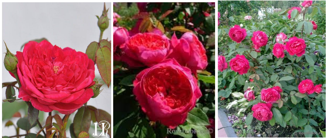
Fig. 34. A flower.