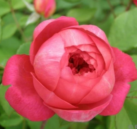
Fig. 29. Blooming.