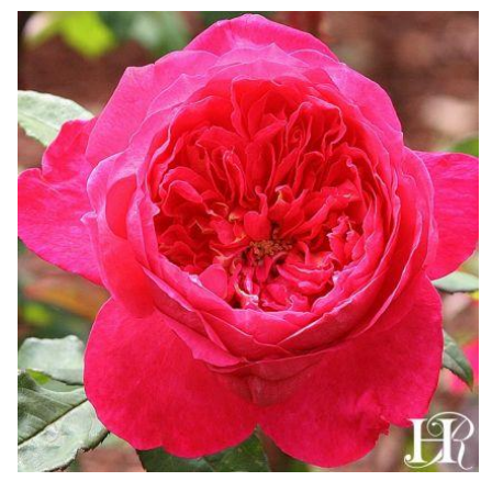
Fig. 31. Cup-shaped rosette.

Family: Rosaceae. Family: English Shrub/Climbing Rose. Plant Family: Rosa - Climbing Roses, Rosa – English Roses, Rosa – Shrub Roses, Rosa – Roses. Habit: Bushy. Name: Rosa 'Ausencart'PBR Alternate Name (s): 'Benjamin Britten'. Class 19a. Breeder: David Austin Breeder Code: AUSencraft Year of Introduction: in United Kingdom by David Austin Roses Limited (UK) in 2001 as 'Benjamin Britten'. Colour: Unusual coloring: glowing deep red-pink. Salmon-Pink ages to Pure Pink flowers in May-October. Blooms in flushes throughout the season. Specific Color: Red with a touch of orange (Fig. 32). Season: Spring (late); Summer, Fall. Bloom Size: Medium. Flowering: Repeat Flowering. Bloom Type: Cupped, Fully Double (Fig. 31). Fragrance: Medium, Fruity. Size: Medium Shrub. Approximate Size: 4 x 3. Height: 120cm to 3 m. Spread: 60-90 cm. Spacing: 90 cm. Fragrance: Strong, intensely fruity fragrance, with hints of wine and pear drops.. Petals: 40+. Water Needs: Average. Maintenance: Average. Soil Type: Chalk, Clay, Sand. Characteristics: Cut Flowers, Fragrant, Showy. Attracts: Butterflies. Sun Aspect: Full Sun - continuous, direct exposure to 6 hours or more of sunlight per day. Garden Uses: Arbors, pergolas, trellises, beds and screens, patio and containers, wall-side borders. Garden Styles: City and courtyard gardens, cottage and informal garden. Soil Moisture: Moist - Soil is moist without being soggy because