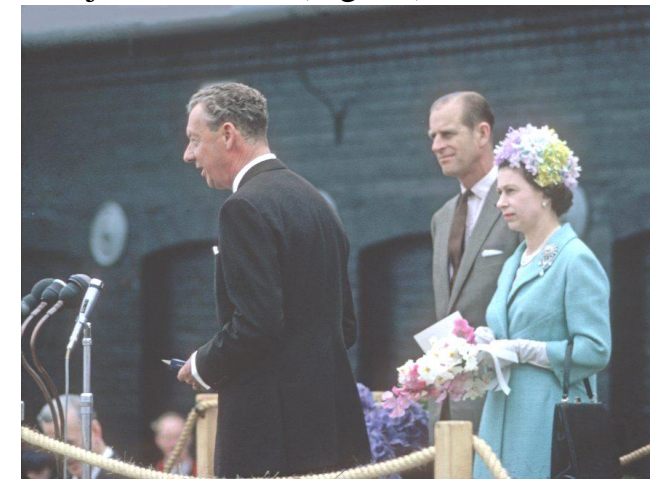
Fig. 18. The Queen and Benjamin Britten. Fig. 19. The founder of the Festival, Benjamin Britten, Photo: Getty (1967). Queen Elizabeth II with her husband Philip, Duke of Edinburgh