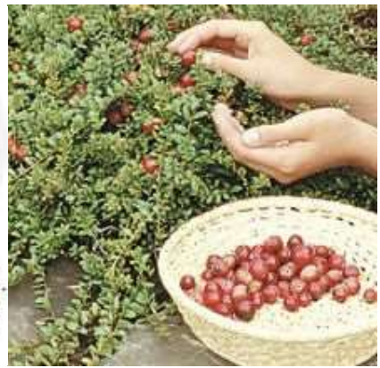
Fig. 23. Cranberry Fruits.

Cranberry seed powder also contains natural vitamin E and its chemical cousins, the tocotrienols, 30 to 50 times more powerful than vitamin E, which quench the full spectrum of free radical toxins which are generated during intense exercise and daily metabolism. The building blocks of cell membranes are phospholipds, fatty acids that