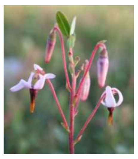
Fig. 40. Flowers.

Flower: Pinkish white, hanging downward, 4 petals strongly curving backwards, usually single but maybe in a small cluster, appearing in mid to late summer (Fig. 40).