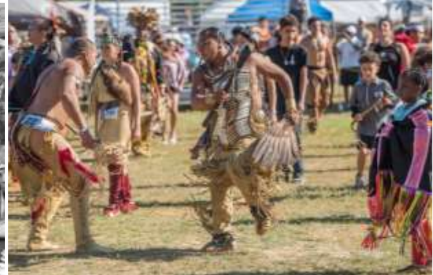
Fig. 5. Mashpee Wampanoag Tribe (1833)[18]. Fig. 6. Mashpee Wampanoag Tribe (2017). Native Americans also used cranberries for dye to color robes, rugs and blankets, and for medicinal purposes (they believed cranberries had a calming effect on nerves, and they made a poultice from cranberries to draw the poison from arrow wounds). Pilgrims learned about the berry from the natives and cranberries became part of the colonial diet as well. The Pilgrims thought the cranberry blossom resembled the head of a sandhill crane and originally called them "crane berries." Sailors began taking cranberries aboard ships for whaling expeditions and the long journeys to China