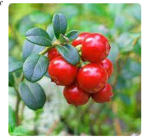
Fig. 9. Massachusetts State Berry: Cranberry.

Chapter 2: Section 39. Berry of commonwealth Section 39. The cranberry (Vaccinium macrocarpon) shall be the official berry of the commonwealth [8; 23] (Fig. 9).