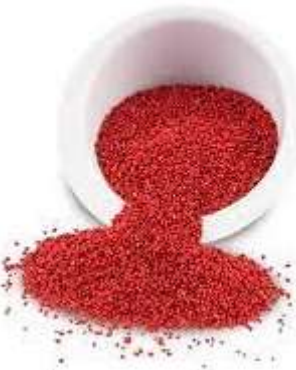
Fig. 22. Seeds.