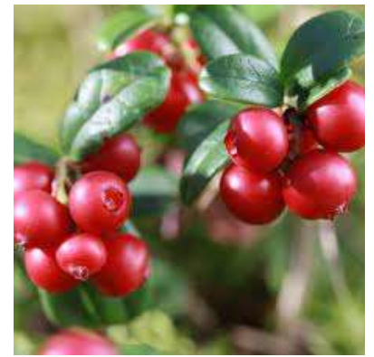
Fig 3. The cranberries.

Of all the fruits only three are native to North America, the cranberry is one of them (Fig. 2. 3, 4). It is a perennial crop grown commercially in man-made wetlands