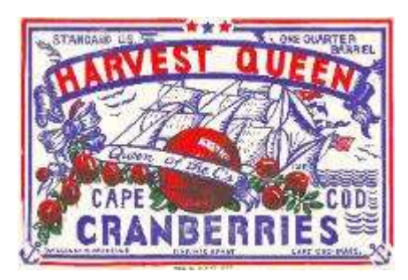
Fig. 27. Howes Brands. Fig. 28. Branding image 'Canal Brand'. Fig. 29. Branding image 'Harvest Queen'.

Roughly 60 percent of the U.S. cranberry crop is produced in Wisconsin, generating close to US$1 billion in revenue and 4,000 jobs. Other top-producing states include Massachusetts, New Jersey, Oregon and Washington. Overall, cranberries are almost exclusively North American. Roughly 85 percent are grown in the United States and Canada, with the rest scattered across Chile, Western Europe and a few former Soviet republics [9].