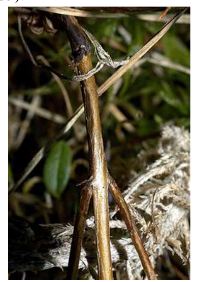
Fig. 41. Cranberry. Bark.