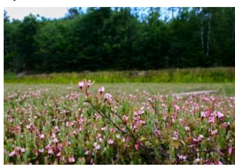
Fig. 24. Cranberry vines and sand.