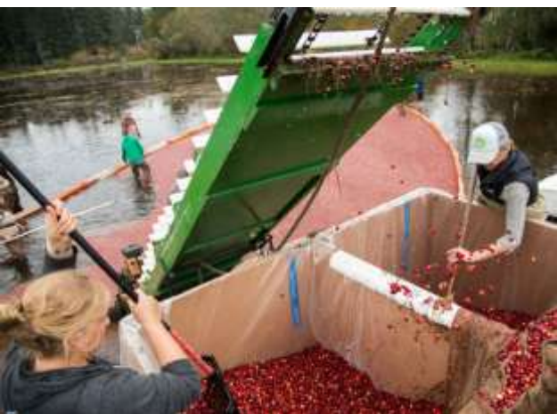
Fig. 34. To harvest cranberries, growers flood the bogs. Fig. 35 The workers collect the floating fruit.

Also in the context of written above, we should return to the meaning of the word CRANBERRY.