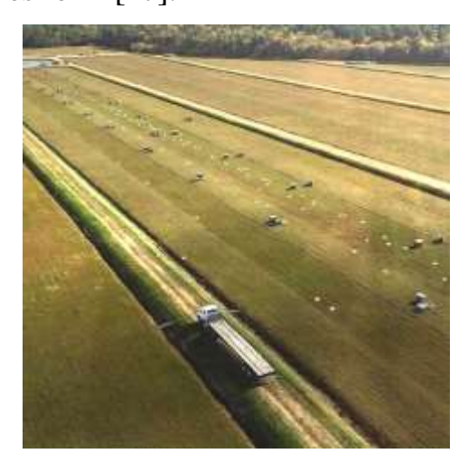
Fig. 30. Wet Harvest.