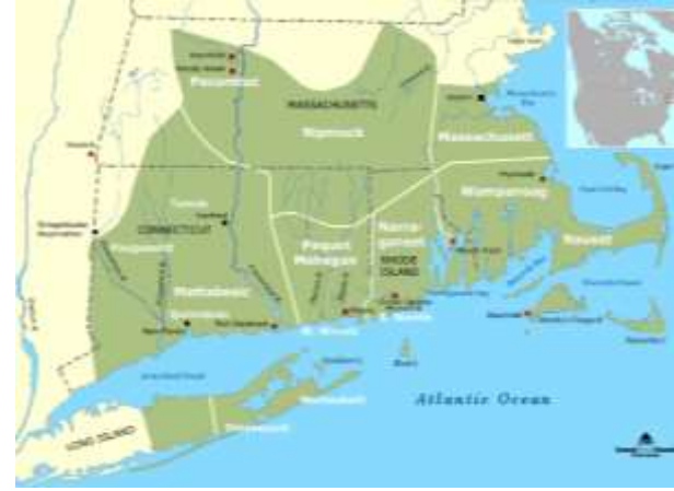
Fig. 7. The USA. Massachusetts State. Fig. 8. Wampanoag (across southeastern Massachusetts).