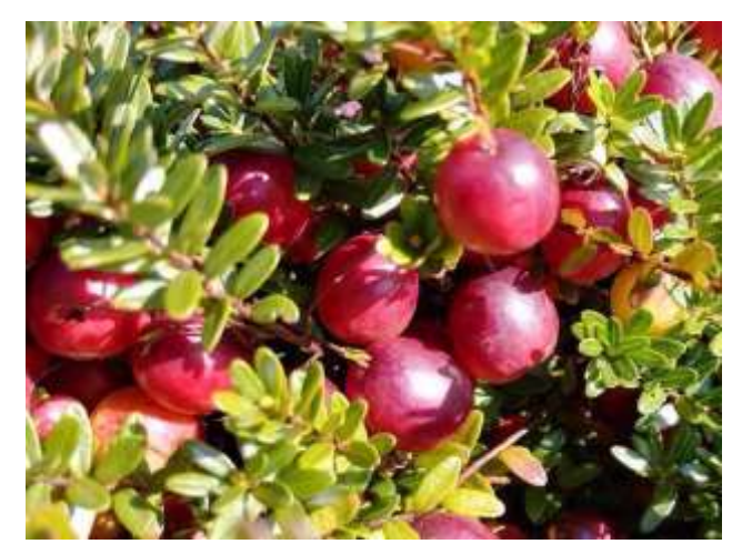
Fig. 37. Vaccinium macrocarpon.

We can improve our spoken English by listening to CRANBERRY pronounced by different speakers – and in example sentences too [9].