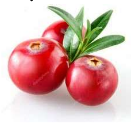
Fig. 39. Cranberry. Fruts.