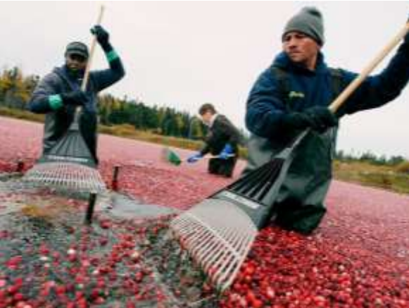
Fig. 32. The cranberry farming process (wet harvesting). Fig. 33. At the farm.