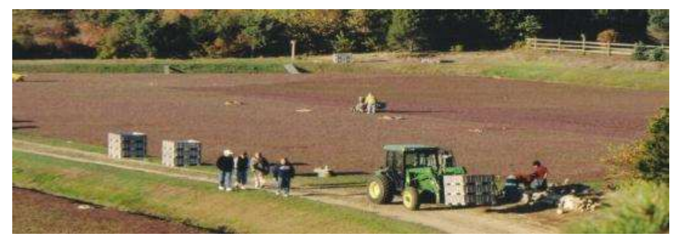
Fig. 26. Cranberry harvest at its Origin, Dennis, Massachusetts (2016).

in standardizing the methodology for branding the variety, size, quality and durability of cranberries which became the Rules for Branding in the 1880's [6].