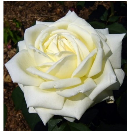
Fig.21. A flower.