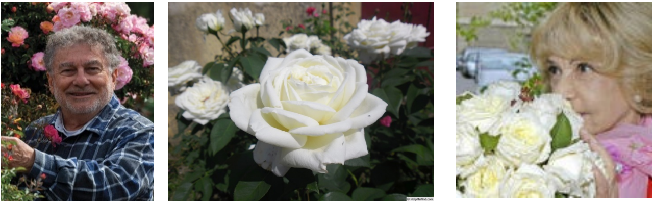
Fig. 16. Breeder Alan Meilland. Fig. 17. Jeanne Moreau Rose. Fig. 18. Actress Jeanne Moreau and roses.

Meilland (Fig. 16) is using the trade name 'Jeanne Moreau' (Fig. 17, 18) for MEIdiaphaz which is sold as a garden rose and for MEIcalanq when sold as a cut rose. The latter is called 'Pierre Ardit', 'White Perfumella', 'Lomonosov' when sold as a garden rose [9], video [29].