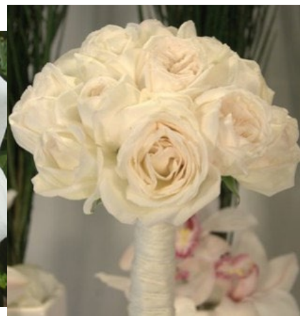
Fig. 24. Bridal bouquet.