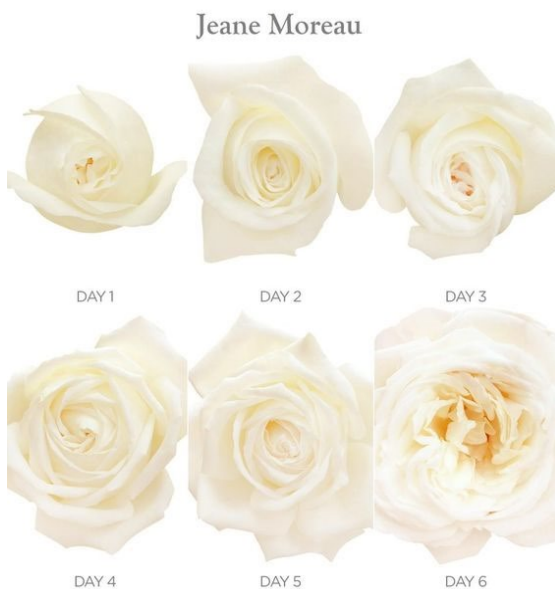
Fig. 19. Life Cycle of growing Roses.

An exceptional rose for a great lady of the French cinema: the white rose Jeanne Moreau is one of the newest hot items in wedding flowers. If you are looking for white gorgeously romantic wedding flowers with a wild, fresh from the garden feel, Jeanne Moreau scented garden roses are for you.