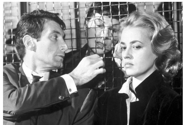
Fig. 7. Lift to the Scaffold (1958).