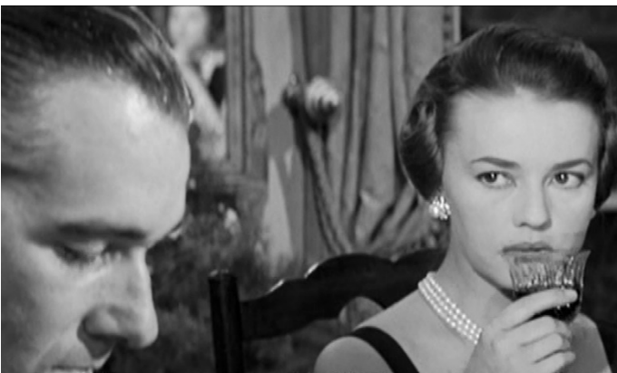
Fig. 6. The Lovers (1958).