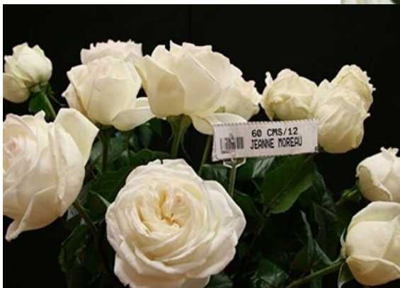
Fig. 22. The rose Jeanne Moreau .