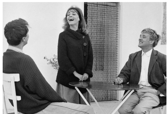
Fig. 5. Jules et Jim (1961).