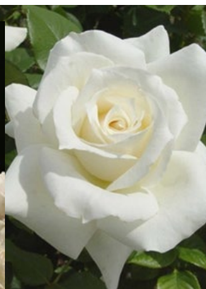
Fig. 23. Flowering.