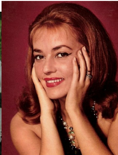
Fig. 2. Actress Jeanne Moreau.