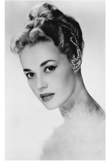
Fig. 20. Actress Jeanne Moreau.

2010: Nantes, France : Fragrance Award [9; 28; 31].