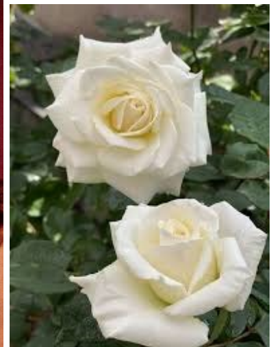
Fig. 3. Jeanne Moreau Rose.