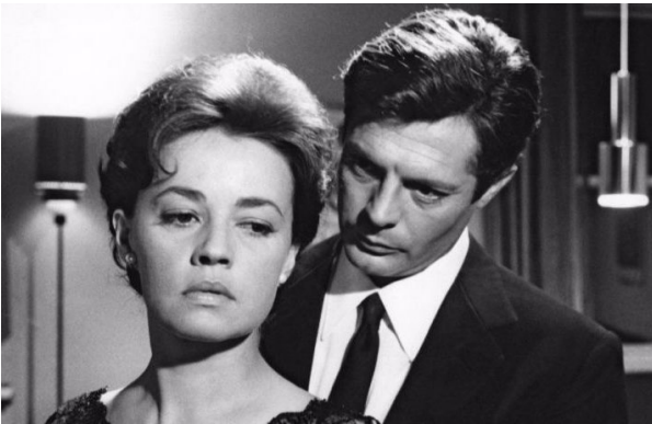
Fig. 4. Night (1961) Marcello Mastroianni.

According to the critic Derek Malcolm : " Moreau was the perfect choice for Catherine : she gives a performance full of gaiety and charm without conveying an empty-headed bimbo. She makes the watcher understand that this is no ordinary woman whom both men adore. It is possibly the most complete portrait of any feminine character in the entire oeuvre of the New Wave" [5].