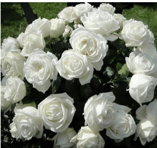
Fig. 1. The Jeanne Moreau Roses.

The rose Jeanne Moreau (Fig. 1; 3), also known as White Perfumella , is a member of the 'Meilland Jardin & Parfum' collection. This collection is a true luxury rose collection with the best scented cut rose varieties of the famous French Rose breeding family Meilland. The Rose Jeanne Moreau received the perfume price in Geneva and Saverne in 2002 and a silver medal in Baden-Baden. In 2008 in Gifu in Japan it won a bronze medal. The rose was baptized Jeanne Moreau in 2005 at the famous florist Henri Moulié in Paris [14; video [29]].